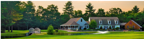
Richmond Country Club

Past charities benefitting have included; Emmanuel House, St. Pius V School, Best Buddies, Rhode Island School for the Deaf, 'A Wish Come True' among many others.